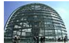
New Parliament Dome